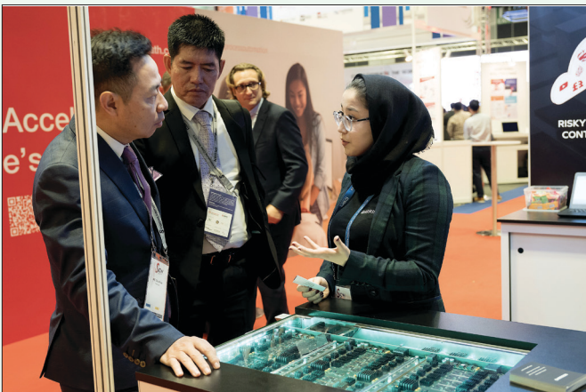
Scenes from Singapore International Cyber Week held in October 2019.

vulnerability management tools with low effort and expertise requirements. It combines static analysis in the form of signature-based matching and metrics to detect vulnerable functions, with dynamic analysis in the form of smart fuzzing to discover memory corruption vulnerabilities. The tools produce highly targeted remediation advice to allow quick and accurate fixes.